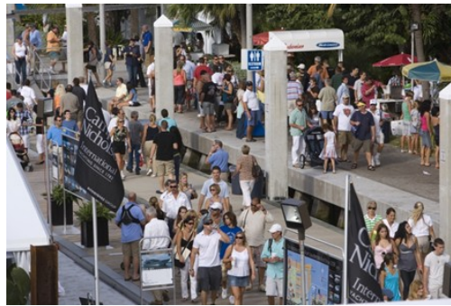
And don't forget the deodorant.

Secondly, this is a pretty hefty show with a 45-year history, hundreds of exhibitors, seminars, and extra ac-