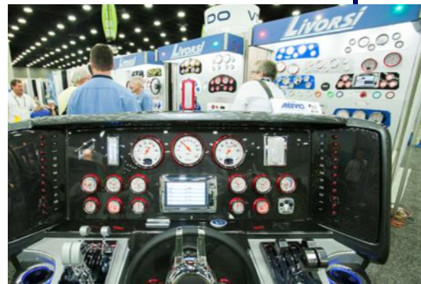
IBEX is known for its hands-on exhibits (above), well-attended general sessions and seminars (below) and where marine innovations make their way to market.

To wrap up the day, IBEX is staging a "Party for a Purpose" from 6 to 8 p.m. at the Sail Pavilion outside the Tampa Convention Center. The event will give media a