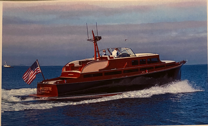
Avocette's lines are very close to the original but her underbelly was redesigned for IPS propulsion by Bill Prince Yacht Design

P icture this. It's 1931 in New York City and the Great Depression hangs low over the city like a thick morning fog that refuses to burn off. For most Americans, these are hard times, filled with baked beans, breadlines and dusty sojourns west in search of work.