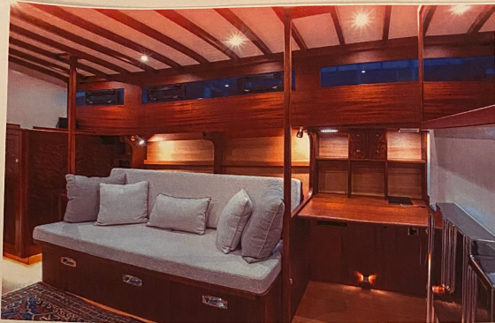
The yacht's refurbished interior includes a convertible master/salon (left and right), an art deco fireplace culled from England (right), and fit and finish befitting a superyacht

108 "When a 48-footer is making the crew of a megayacht gawk, you know you've got something truly special"